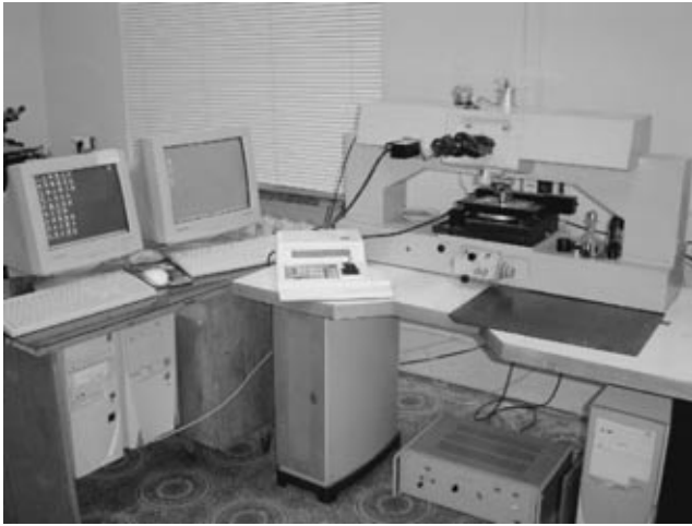
Fig. 1. View of the automatic PAVICOM-2 microscope.

new method provides a possibility of processing large amounts of experimental data, essentially increases the expected event statistics in a wide range of experiments, and predetermines development of new experimental projects which can use large-volume targets and large-area emulsion and solid-state track detectors [1].