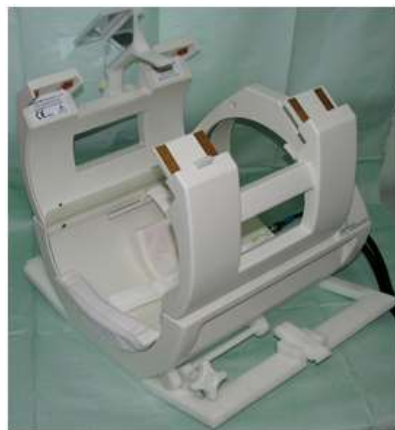
Figure 1 (a). Twin 1H-31P coil.