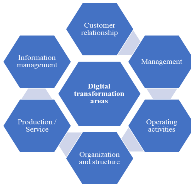
Figure 1. Functional areas of digital business transformation

Based on the results of the analysis, six main functional areas of a company are formulated that require digital transformation (Figure 1).