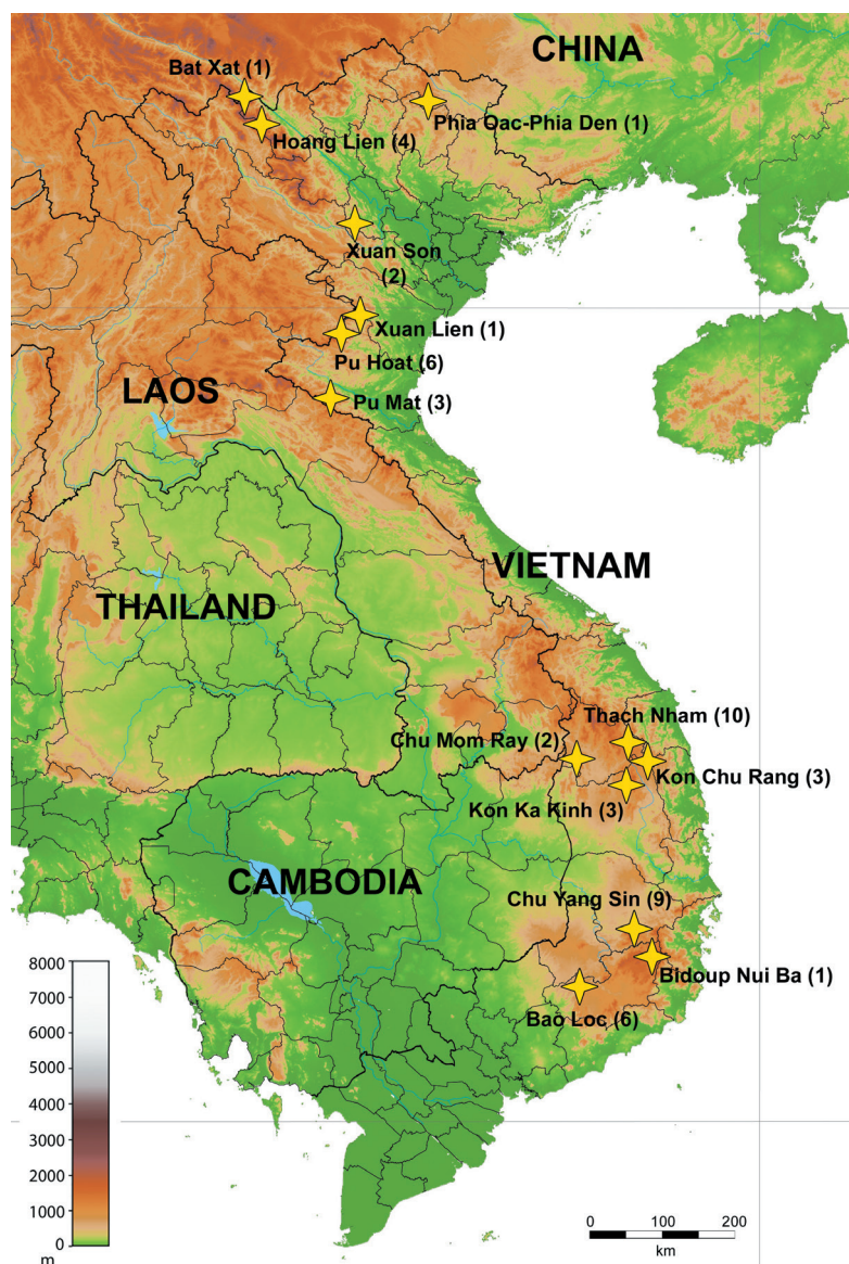
Figure 2. Map of Vietnam with localities of our collections. Figures in brackets represent number of collected non-photosynthetic plant species.