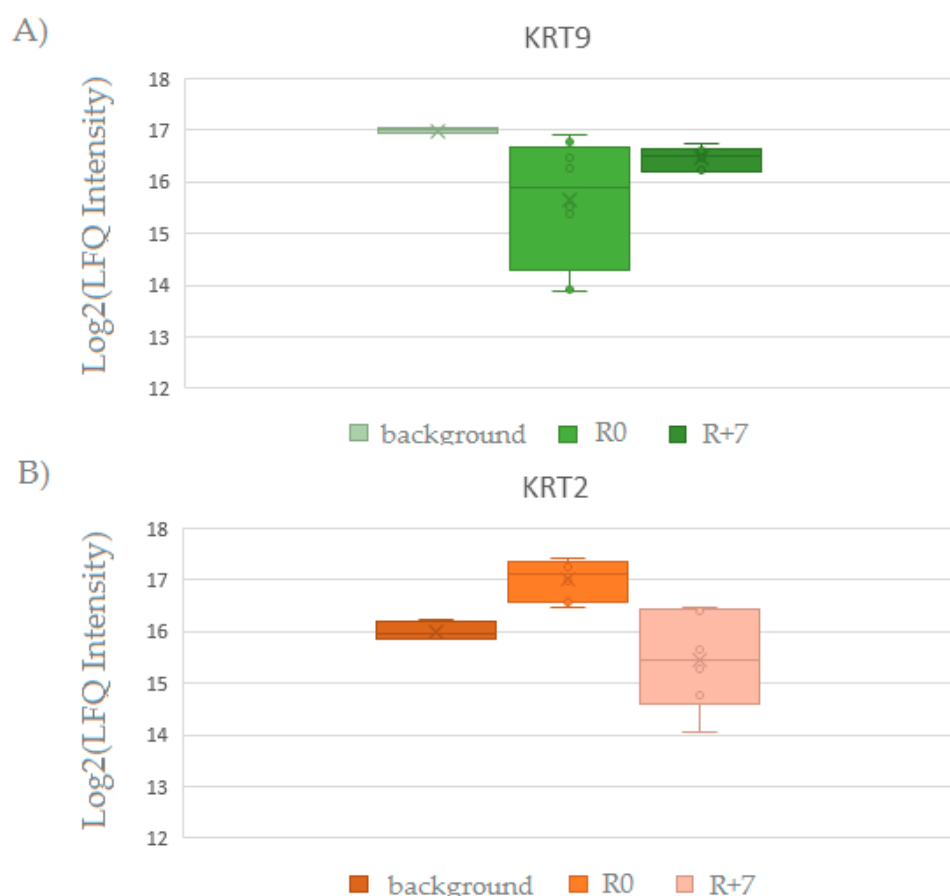
Figure 2. The label-free quantification (LFQ) intensity box plot for KRT9 (A) and KRT2 (B) proteins which changed their levels after landing, with respect to the background. The LFQ values are plotted on a \text{Log}_2(x) scale along the vertical axis.

Previously we showed that overexpression of stress- or stimulus-associated proteins can be detected in urine on the 1st day after landing [13]. Most of the urine significant proteins that are associated with stress factors returns to its preflight levels up to the 7th day. On other hand, EBC and blood plasma proteome analysis revealed significantly changing proteins associated with the immune response. It is worth noting that plasma proteome changes due to the space flight correlates with results of ground based experiments such as head-down bed rest (HDBR) and dry immersion experiments [47].