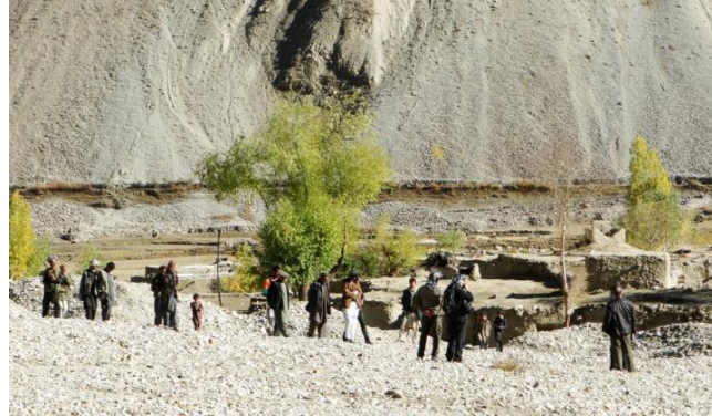
Fig. 2. Village partially destroyed by GLOF.