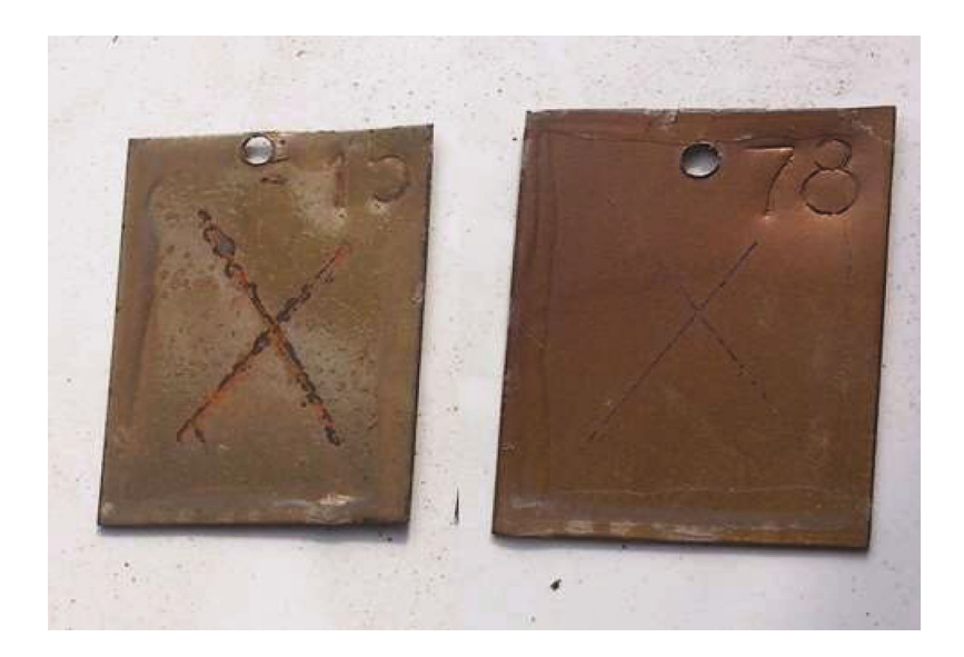
Fig. 4. (Color online) Photos of specimens after salt resistance testing by submerging into a 3% NaCl solution: polymer coating (left) and nickel–polymer coating (right).

The composition of the crystalline phase of metal– polymer coatings was studied by X-ray diffraction. Calculations show that the nickel–polymer coating contains nickel–iron intermetallide instead of pure iron. The formed metal–polymer coating has a cubic symmetry system (symmetry group 1m3mc) with a unit-cell parameter a = 0.2868 nm and has a structure composed of four parallel differently oriented kamac-