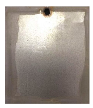
Fig. 3. (Color online) Photo of the zinc-polymer coating after testing for 6000 h in water (GOST 9.083-78, ISO 12944).

(nanotubes and clusters of nanosized metals). The photos of the morphology of coatings at a magnification of \times 10^7 are shown in Fig. 2.